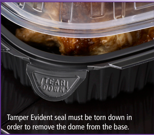
Tamper Evident seal must be torn down in order to remove the dome from the base.