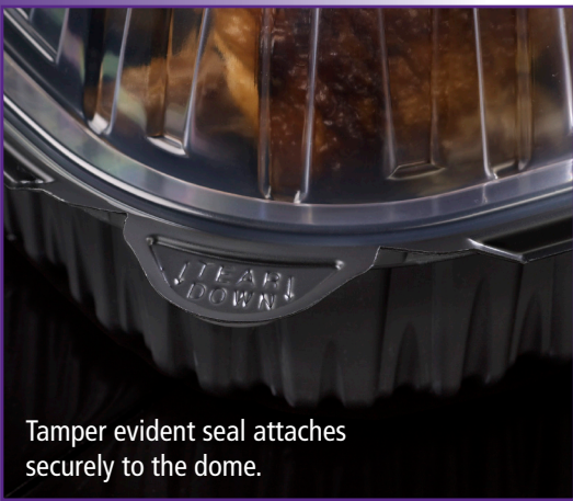
Tamper evident seal attaches securely to the dome.