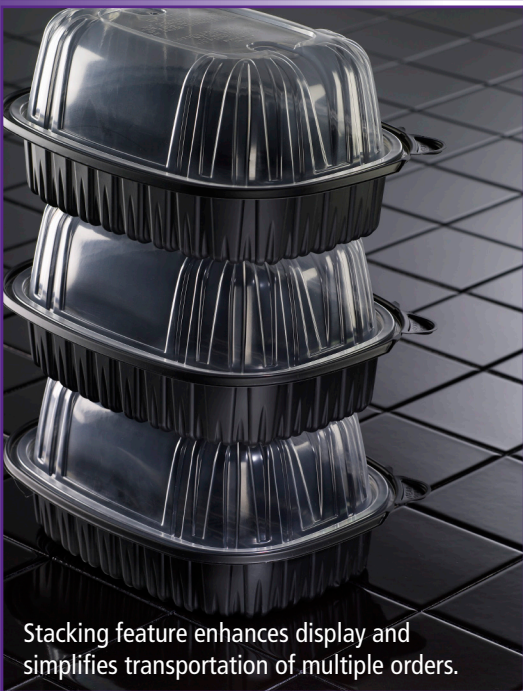
Stacking feature enhances display and simplifies transportation of multiple orders.

The new ClearView™ MealMaster™ Medium Tamper Evident Chicken Roaster with co-extruded Fog Gard™ gives you all the features you've come to expect from Pactiv, and a great deal more – venting, and a new Tamper Evident Closure System that prevents leakage and enhances overall food safety.